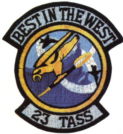
23 rd Tactical Air Support Squadron emblem